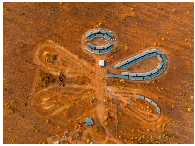
Figure 7: 'Dragonfly' Accommodation Village north-east wing

The overall capacity of the accommodation village has been expanded from 407 to 660 rooms to ensure that the construction schedule will not be impacted by a tightening of regional room availability.