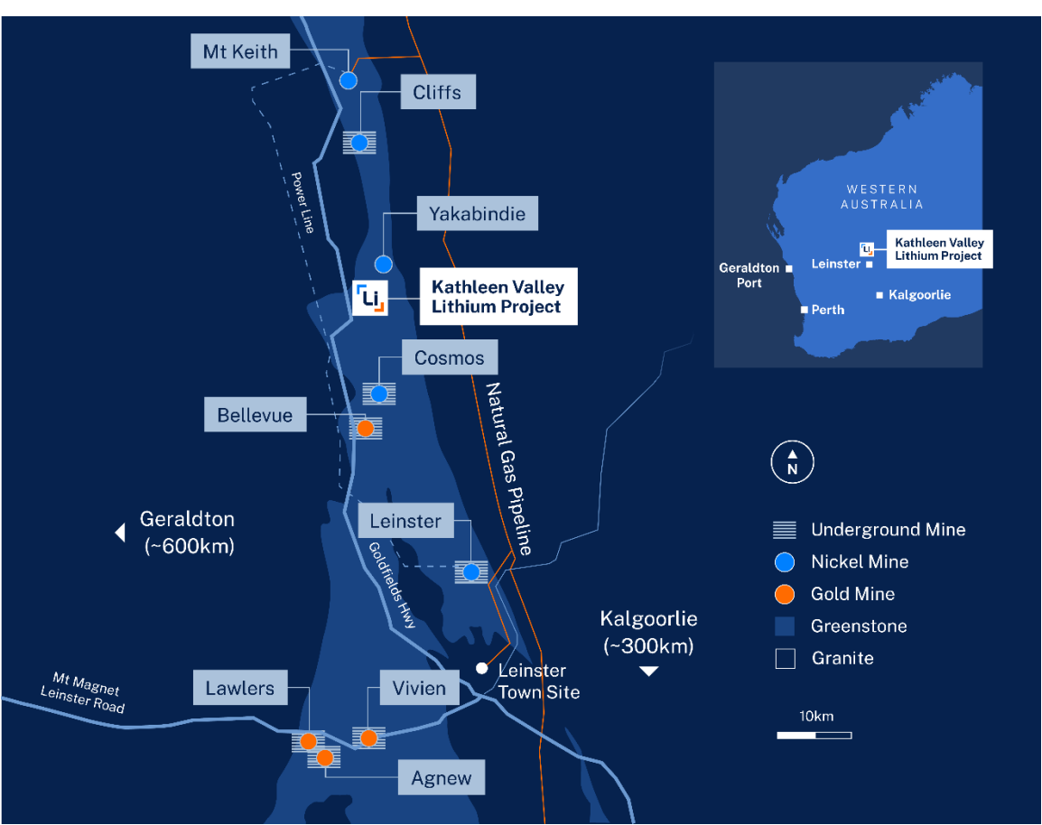
Figure 12: Kathleen Valley Lithium Project – Location and Geology Map

Liontown's Board approved the full development of Kathleen Valley in June 2022. The Final Investment Decision (FID) followed execution of offtake agreements with LG Energy Solution, Tesla and Ford Motor Company (Ford), together with a A$300 million debt facility with leading global automaker, Ford.