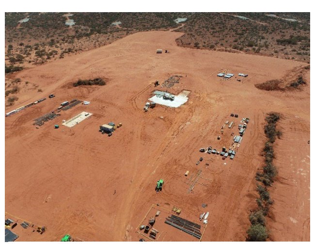
Figure 4: Fine ore bin foundation pouring commenced

IMC were also issued a Notice of Award for the Tailings Storage Facility (TSF) which is expected to optimise the movement of waste material generated by open pit mining activities.