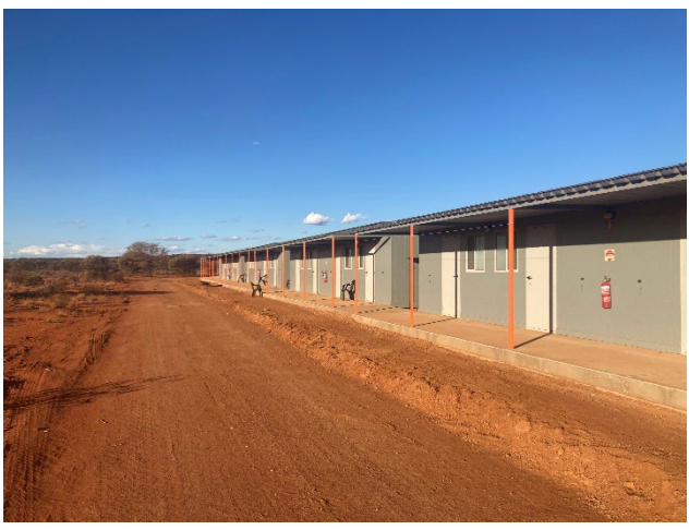
Figure 8: 157 rooms completed and occupied at quarter-end